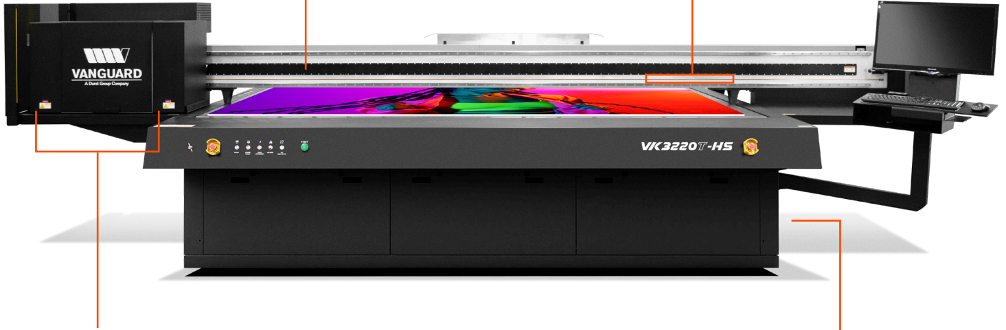
STATIC SUPPRESSION BARS TAKK in Cincinnati, Ohio