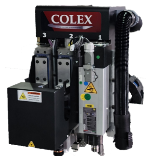
Triple tool head